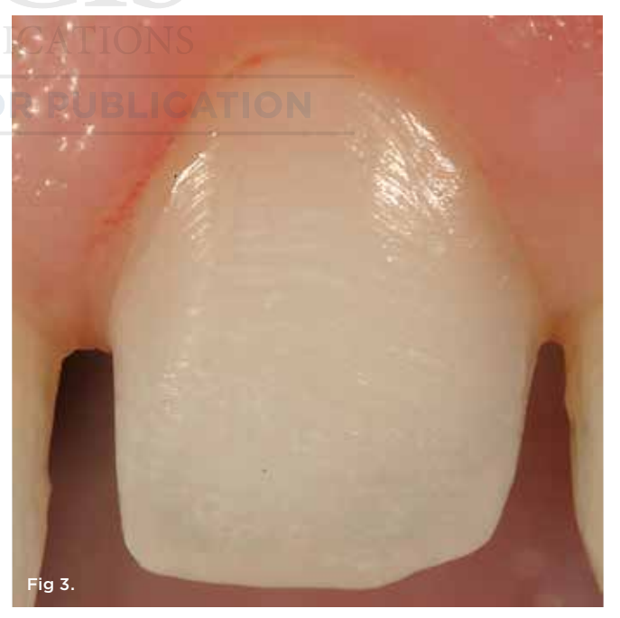
Fig 2. Photograph of a no-preparation to practically preparationless Class I veneer preparation. Fig 3. Close-up of the Class I veneer preparation highlights the bur marks and finish line created to assist the ceramist. Note that the finish line is subgingival due to the cervical contour change required to close diastemas on the mesial and distal.