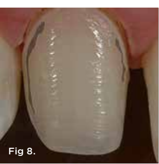
Fig 5. Photograph of a minimally invasive or modified prepless Class II veneer preparation design. Fig 6. Close-up of a Class II veneer preparation demonstrating a minimal intervention to modified preparation design in facial reduction of up to 0.5 mm. Fig 7. Close-up occlusal view of the Class II veneer preparation with a minimal intervention to modified preparation design. Fig 8. Photograph of the Class II veneer preparation demonstrating dentin exposure of 5% to 10%, less than the 20% maximum.